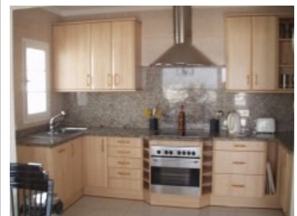
Fully Fitted Kitchen (right)